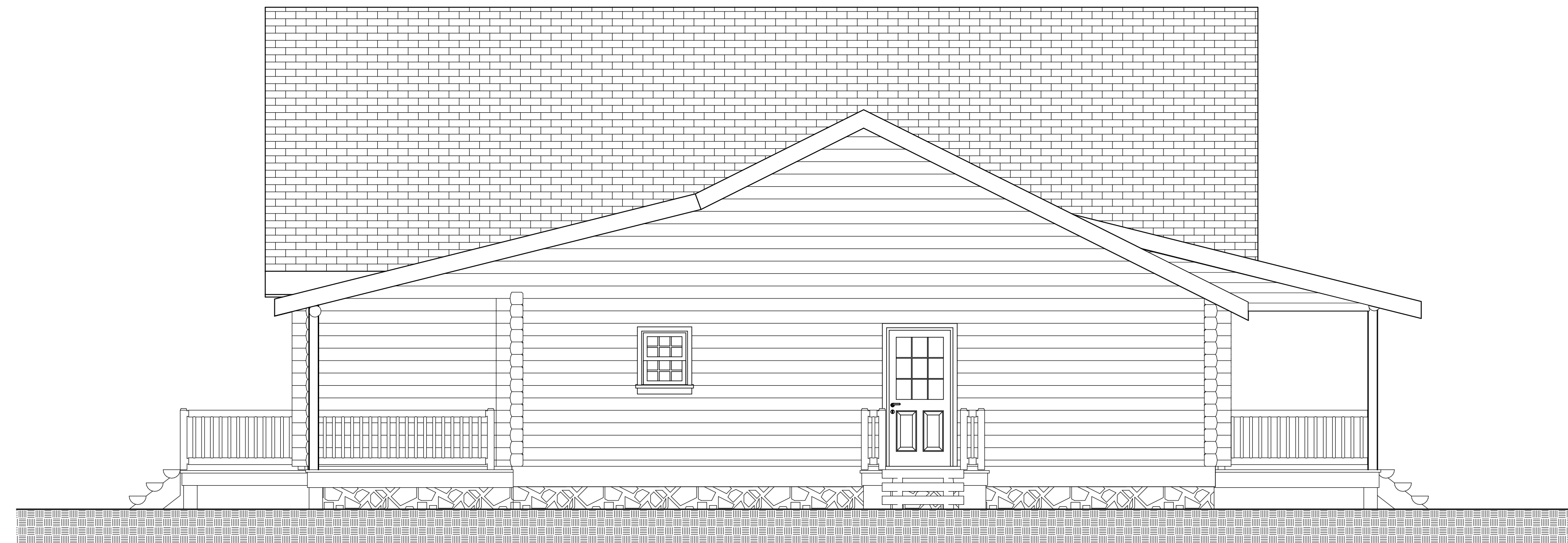
LEFT ELEVATION SCALE: 1/4" = 1'-0"