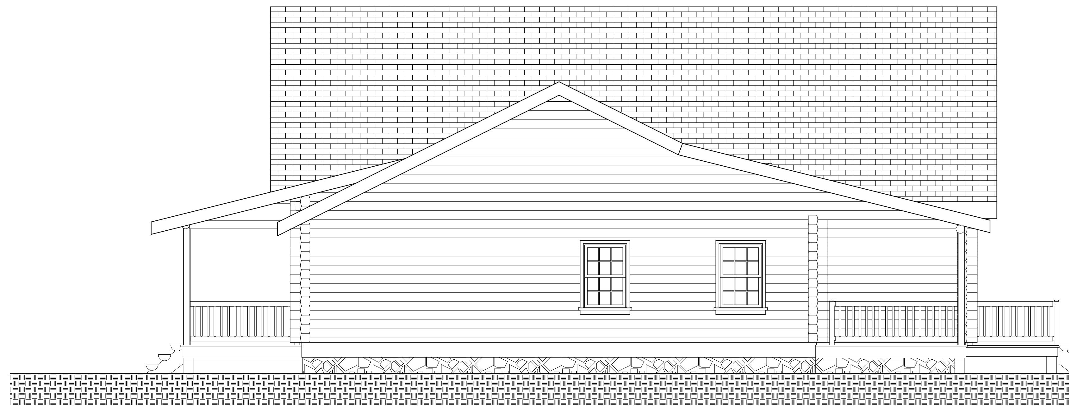
○ RIGHT ELEVATION SCALE: 1/4" = 1'-0"