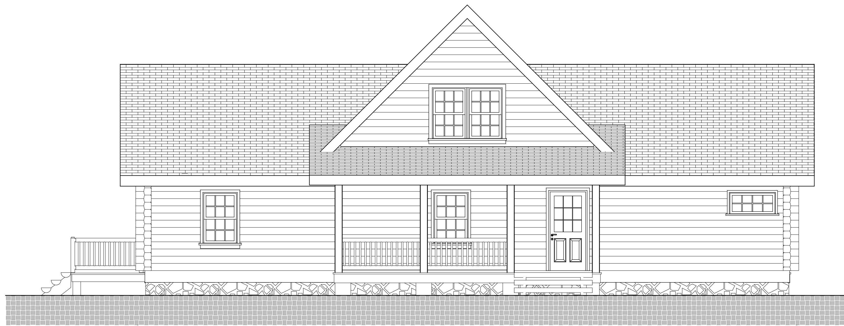
○ FRONT ELEVATION SCALE: 1/4" = 1'-0"